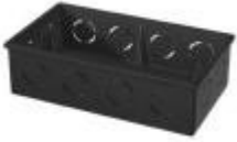
Size 138 x 75 x 38