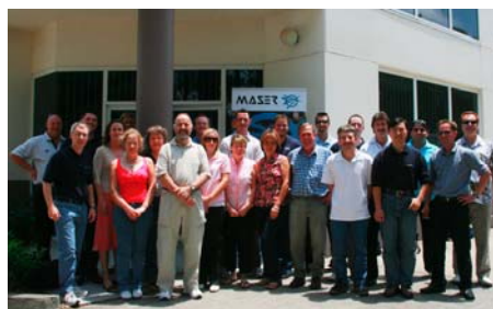
Maser Australia's group photo